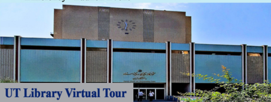
UT Library Virtual Tour